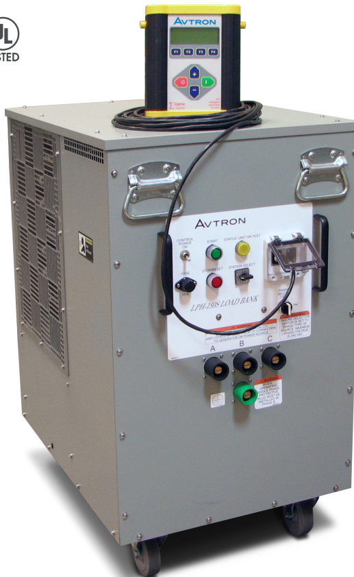
LPH150S 150 KW Portable Avtron Load Bank shown with IHT Hand-Held Terminal.